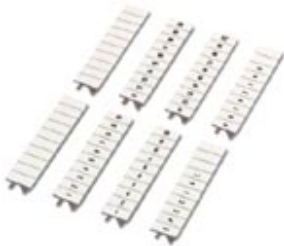
Zack marker strip, 10-section, vertically labeled with the consecutive numbers: 291 ... 300, white, width: 5 mm

Please be informed that the data shown in this PDF Document is generated from our Online Catalog. Please find the complete data in the user's documentation. Our General Terms of Use for Downloads are valid ( http://phoenixcontact.com/download )