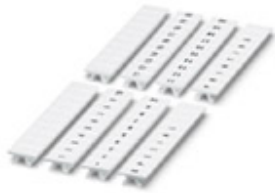
Zack marker strip, 10-section, horizontally labeled with the consecutive numbers: 21 ... 30, white, width: 5 mm

Please be informed that the data shown in this PDF Document is generated from our Online Catalog. Please find the complete data in the user's documentation. Our General Terms of Use for Downloads are valid ( http://phoenixcontact.com/download )