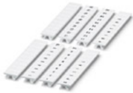
Zack marker strip, 10-section, horizontally labeled with the consecutive numbers: 1 ... 10, white, width: 5 mm

Please be informed that the data shown in this PDF Document is generated from our Online Catalog. Please find the complete data in the user's documentation. Our General Terms of Use for Downloads are valid ( http://phoenixcontact.com/download )