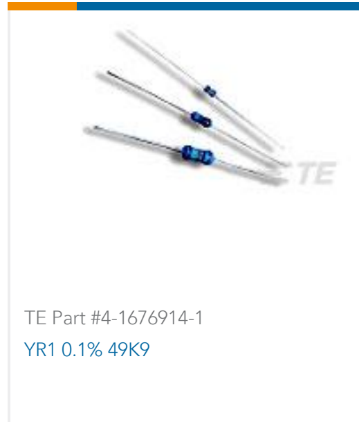
TE Part #4-1676914-1 YR1 0.1% 49K9