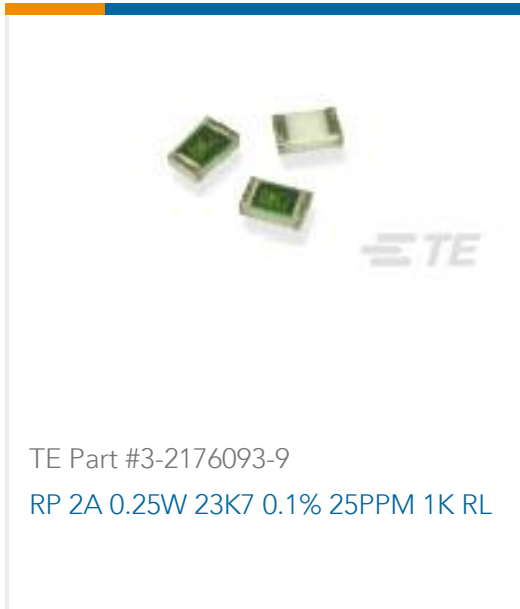
TE Part #3-2176093-9 RP 2A 0.25W 23K7 0.1% 25PPM 1K RL