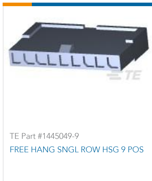
TE Part #1445049-9 FREE HANG SNGL ROW HSG 9 POS