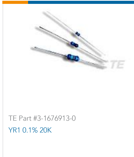
TE Part #3-1676913-0 YR1 0.1% 20K