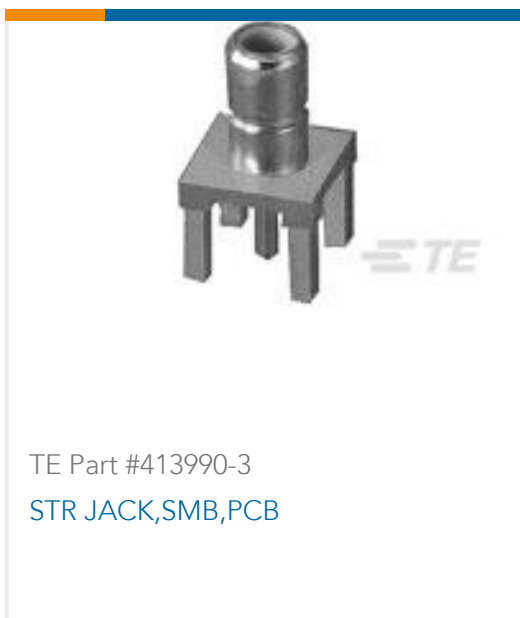
TE Part #413990-3 STR JACK,SMB,PCB