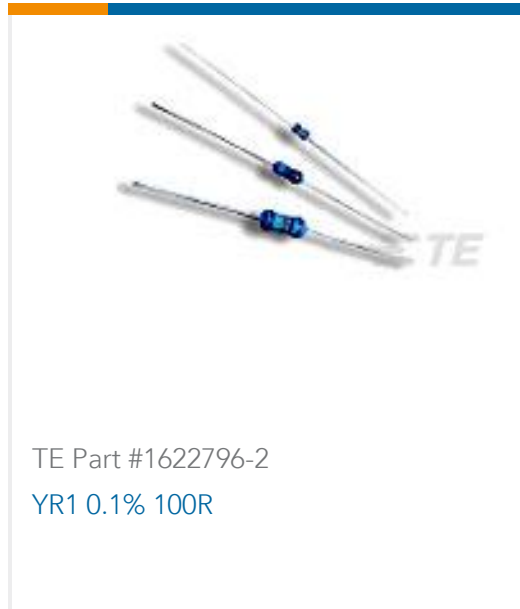
TE Part #1622796-2 YR1 0.1% 100R