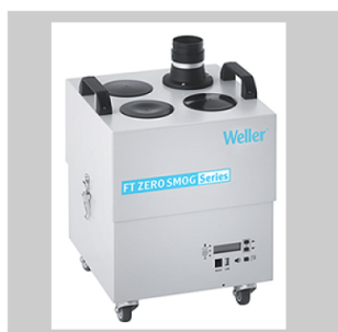
Solder fume extractors