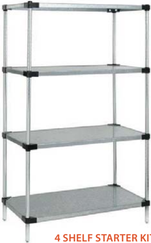
4 SHELF STARTER KITS

Set of four swivel polyurethane 5" x 1-1/4" casters, two with brakes. Can be used with all units shown. 1,200 lb. load capacity. *Mobile kits recommended only for shelves 18" and wider.