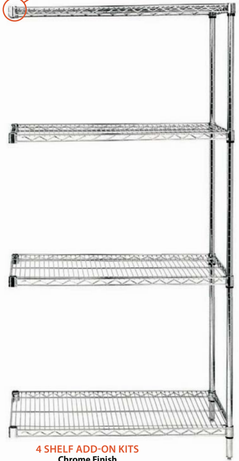
4 SHELF ADD-ON KITS Chrome Finish

S-HOOKS For continuous runs of shelving. Two hooks should be placed per shelf where two posts are not utilized.