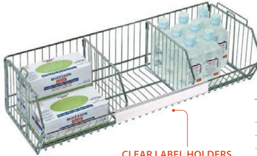
1436BC Shown with Dividers and Clear Label Holder (Sold separately)

Offer a variety of storage, display and mobile supply applications. Dividers can be used to separate product. Accessible front and a wide selection of sizes allow for all types of product to be used from storage to display. (Dividers sold separately) Finish: Chrome