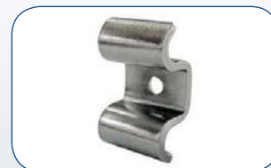
WLP-DMC Direct Mount Clips - 4 pack (Included with wire louvered panels) Extra packages available (if needed). (Sold separately)