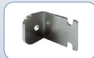
WLP-OSC Offset Mount Clips - 4 pack Offsets panel from wall surface allowing one to clean behind panel (Sold separately)