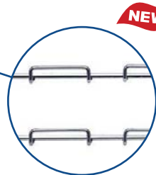
WLP-1836C 36" L x 18" H Accepts all sizes of Ultra Stack & Hang Bins and Mesh Bins. Includes 8 direct mount clips. 175 lb. load capacity.