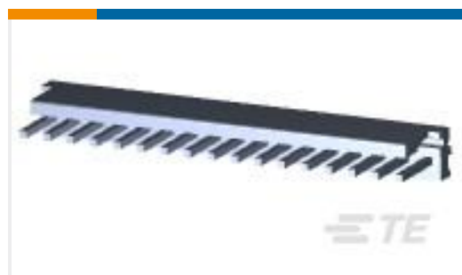
TE Model / Part #1-640445-7 17P MTA156 HDR ASSY FL /STR SN