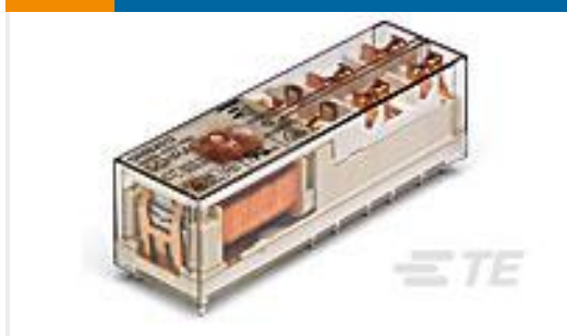
TE Model / Part #3-1415353-1 SR6M4024