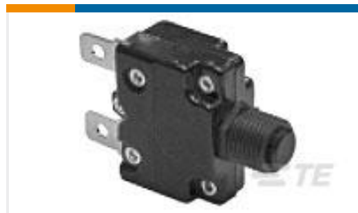
TE Model / Part #9-1423364-9 W57-XB1A7A10-20=CKTBKR,THERM,PB, SCW/QC