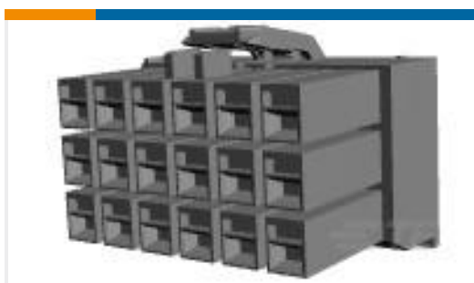
TE Model / Part #176280-9 UNIV POWER PLUG HSG 18P F/H