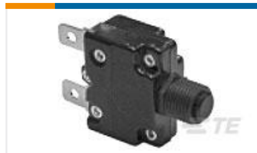
TE Model / Part #9-1423364-6 W57-XB1A7A10-5=CKTBKR,THERM,PB, SCW/QC