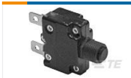
TE Model / Part #9-1423364-7 W57-XB1A7A10-10=CKTBKR,THERM,PB,