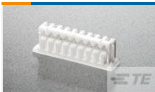
TE Model / Part #1-440146-5 1.25mm WTB Socket, Housing,15p