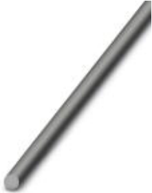
Connection pin, plastic, for coupling two fuse terminal blocks, color: black, diameter: 3 mm

Please be informed that the data shown in this PDF Document is generated from our Online Catalog. Please find the complete data in the user's documentation. Our General Terms of Use for Downloads are valid ( http://phoenixcontact.com/download )