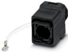
Protective cover, IP67, to cover the contact insert in the RJ45 and SC-RJ push-pull panel mounting frames

Please be informed that the data shown in this PDF Document is generated from our Online Catalog. Please find the complete data in the user's documentation. Our General Terms of Use for Downloads are valid ( http://phoenixcontact.com/download )