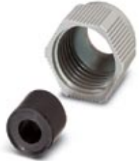
D-SUB cap nut with line seal, for sleeve housing VS-09-..., conductor diameter of 5 mm ... 9 mm

Please be informed that the data shown in this PDF Document is generated from our Online Catalog. Please find the complete data in the user's documentation. Our General Terms of Use for Downloads are valid ( http://phoenixcontact.com/download )