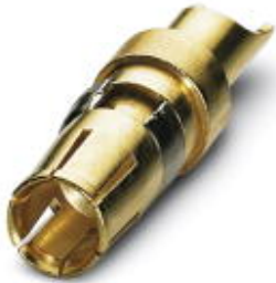
Power contacts, for D-SUB combination inserts, socket, solder cup, straight, rated current 20 A, gold-plated

Please be informed that the data shown in this PDF Document is generated from our Online Catalog. Please find the complete data in the user's documentation. Our General Terms of Use for Downloads are valid ( http://phoenixcontact.com/download )