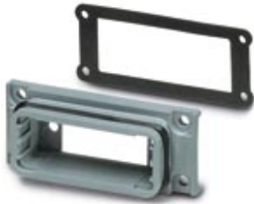
D-SUB panel mounting frame, shell size 2, IP67 degree of protection

Please be informed that the data shown in this PDF Document is generated from our Online Catalog. Please find the complete data in the user's documentation. Our General Terms of Use for Downloads are valid ( http://phoenixcontact.com/download )