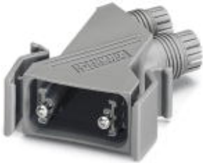
D-SUB sleeve housing, shell size 1, IP67 degree of protection

Please be informed that the data shown in this PDF Document is generated from our Online Catalog. Please find the complete data in the user's documentation. Our General Terms of Use for Downloads are valid ( http://phoenixcontact.com/download )