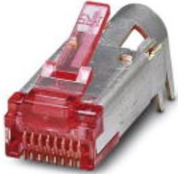
RJ45 male insert, CAT6, 8-pos., shielded, IDC pierce connection, for AWG 27 litz wires ... 24, with strain relief

Please be informed that the data shown in this PDF Document is generated from our Online Catalog. Please find the complete data in the user's documentation. Our General Terms of Use for Downloads are valid ( http://phoenixcontact.com/download )