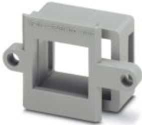
RJ45 panel mounting frame, 1x, IP20, for modular socket inserts (Keystone), without mounting screws

Please be informed that the data shown in this PDF Document is generated from our Online Catalog. Please find the complete data in the user's documentation. Our General Terms of Use for Downloads are valid ( http://phoenixcontact.com/download )