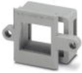
RJ45 panel mounting frame, 1x, IP20, for modular socket inserts (Keystone), without mounting screws

Panel mounting frames - VS-08-A-RJ45/MOD-1-IP20 - 1689433