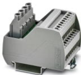
VARIOFACE module, with two equipotential busbars (P1, P2) for potential distribution, for mounting on NS 35 rails. Module width: 90.8 mm

Please be informed that the data shown in this PDF Document is generated from our Online Catalog. Please find the complete data in the user's documentation. Our General Terms of Use for Downloads are valid ( http://phoenixcontact.com/download )