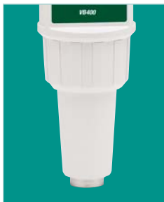
Magnetic base included