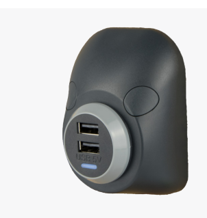
Protective Pod for wall mounted or retrofit intsallations

The Wall Mounted Pod is moulded from dark grey glass-filled polycarbonate (RAL colour 7016) which is durable and scuff resistant.