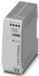
Primary-switched UNO POWER power supply for DIN rail mounting, input: 1-phase, output: 12 V DC/55 W

Please be informed that the data shown in this PDF Document is generated from our Online Catalog. Please find the complete data in the user's documentation. Our General Terms of Use for Downloads are valid ( http://phoenixcontact.com/download )