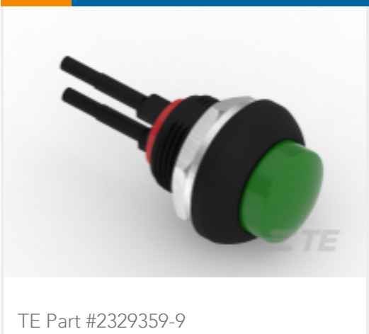
PB ON/OFF HC GRE M1 TERM IP68 500MM LHS