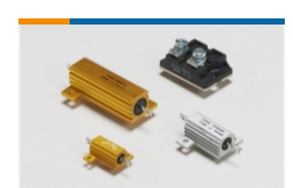
Chassis Mount Resistors(747)