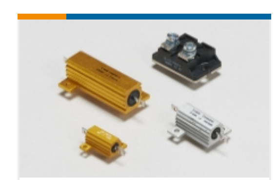
Chassis Mount Resistors(747)