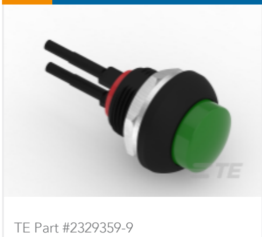
PB ON/OFF HC GRE M1 TERM IP68 500MM LHS