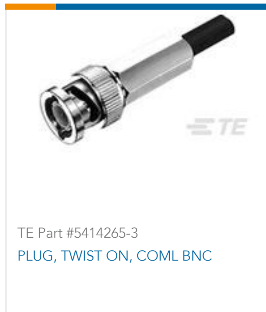
TE Part #5414265-3 PLUG, TWIST ON, COML BNC