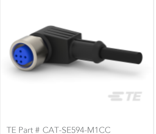
M12 A-CODE FEMALE R/A PIGTAIL