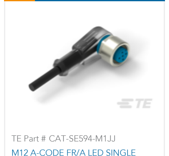
M12 A-CODE FR/A LED SINGLE ENDED CABLE