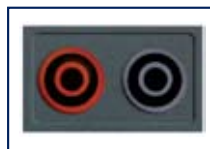
Jacks: Two standard safety banana jacks (4mm)