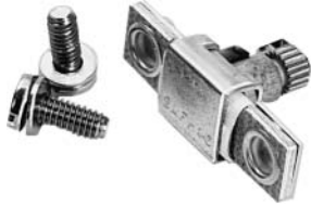
Heater Elements Class SMF