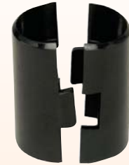
WR-SSCO Plastic Conductive Split Sleeve Sold as a pack of 4 pairs.