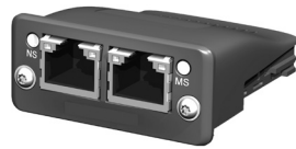
Active - (Industrial Ethernet)