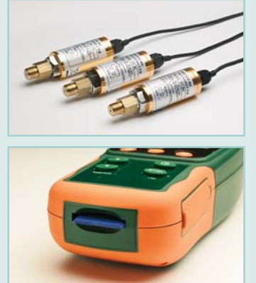
Measure pressure in hydraulic shop presses and other industrial machines.