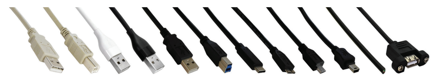
Connector End B Options