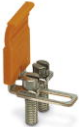
Switching jumper, Number of positions: 2, Color: silver

Please be informed that the data shown in this PDF Document is generated from our Online Catalog. Please find the complete data in the user's documentation. Our General Terms of Use for Downloads are valid ( http://phoenixcontact.com/download )