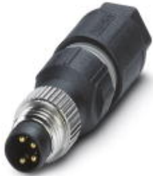
Sensor/actuator connector, 4-position, Plug straight M8, A-coded, Insulation displacement connection, Knurl material: Zinc die-cast, nickel-plated, External cable diameter 2.5 mm ... 5 mm

Please be informed that the data shown in this PDF Document is generated from our Online Catalog. Please find the complete data in the user's documentation. Our General Terms of Use for Downloads are valid ( http://phoenixcontact.com/download )