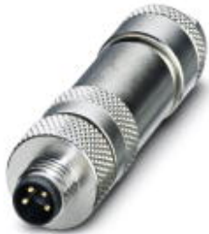
Connector, 4-position, shielded, Plug straight M8, A-coded, Screw connection, Knurl material: Nickel-plated brass, External cable diameter 3.5 mm ... 5.5 mm

Please be informed that the data shown in this PDF Document is generated from our Online Catalog. Please find the complete data in the user's documentation. Our General Terms of Use for Downloads are valid ( http://phoenixcontact.com/download )