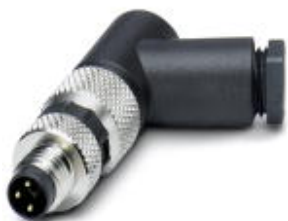
Connector, 3-position, Plug angled M8, A-coded, Screw connection, Knurl material: Nickel-plated brass, External cable diameter 3.5 mm ... 5 mm

Please be informed that the data shown in this PDF Document is generated from our Online Catalog. Please find the complete data in the user's documentation. Our General Terms of Use for Downloads are valid ( http://phoenixcontact.com/download )