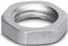
Flat nut with M5 thread

Please be informed that the data shown in this PDF Document is generated from our Online Catalog. Please find the complete data in the user's documentation. Our General Terms of Use for Downloads are valid ( http://phoenixcontact.com/download )