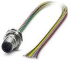
Sensor/actuator flush-type plug, 8-pos., M12-SPEEDCON, rear/screw mounting with Pg9 thread, with 0.5 m TPE litz wire, 8 x 0.25 mm 2

Please be informed that the data shown in this PDF Document is generated from our Online Catalog. Please find the complete data in the user's documentation. Our General Terms of Use for Downloads are valid ( http://phoenixcontact.com/download )