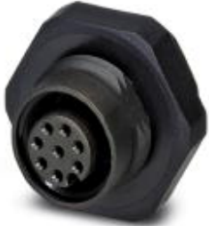
Sensor/actuator flush-type connector, socket, 8-pos., M12, A-coded, rear/screw mounting with Pg9 thread, with solder cups, plastic version

Please be informed that the data shown in this PDF Document is generated from our Online Catalog. Please find the complete data in the user's documentation. Our General Terms of Use for Downloads are valid ( http://phoenixcontact.com/download )