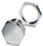
M16 screw plug for unused M12 housing cutouts

Screw plug - SACC-M16-SEALING PLUG SET - 1453368