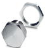
M16 screw plug for unused M12 housing cutouts

Screw plug - SACC-M16-SEALING PLUG SET - 1453368