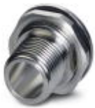
Sample set, PlugLink:M12, Rear mounting, M15 x 1

Sample set - SACC-BP-M-M12/M15-6-THR SP - 1421842