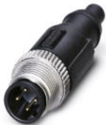
Terminating resistor PROFIBUS M12

Please be informed that the data shown in this PDF Document is generated from our Online Catalog. Please find the complete data in the user's documentation. Our General Terms of Use for Downloads are valid ( http://phoenixcontact.com/download )