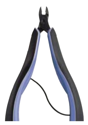
3. Close the tool.