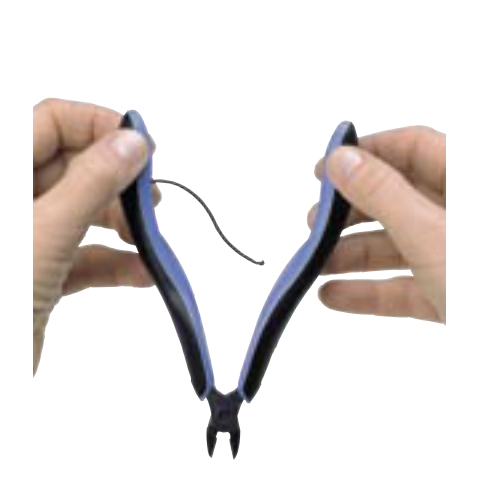
1. Pull the tool apart.