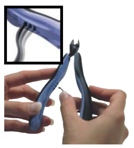
2. Place the spring in the desired port.