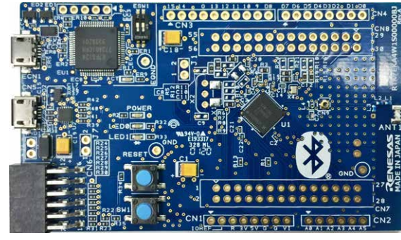
Evaluation Kit: RTK7EKA4W1S00000BJ