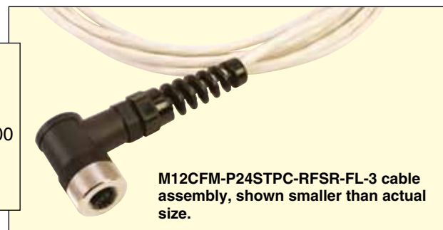
M12CFM-P24STPC-RFSR-FL-3 cable assembly, shown smaller than actual size.