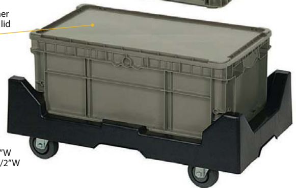
DLY-2415 Interior Dimensions 24"L x 15"W Exterior Dimensions 28"L x 18-1/2"W