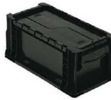
RSO1408-7 available in Black only and with an attached lid.

* Cannot be used on DLY-2415. Use with DLY-3018 Dolly.