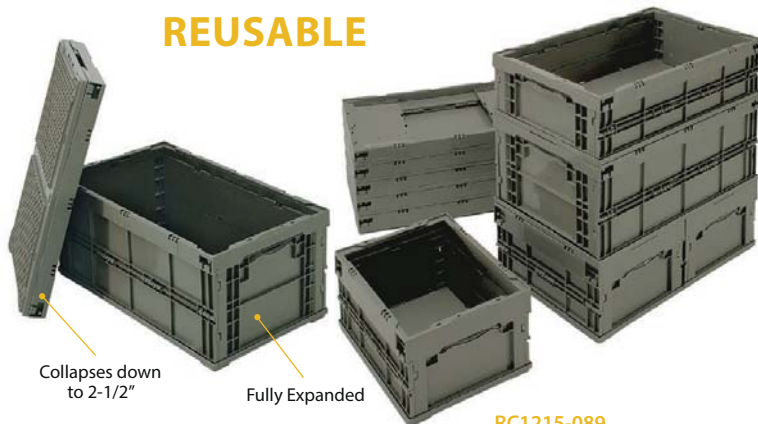
RC2415-075 RC2415-111 RC2415-089