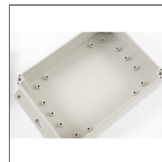
Internal mounting points for PC boards or panels